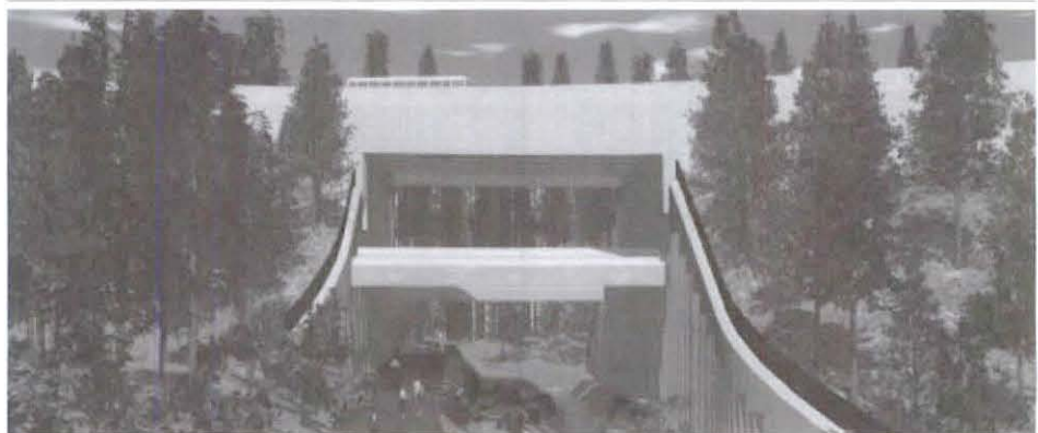
A conceptual drawing of the proposed Marine View Drive bridge, scheduled to start construction in February. Turn to page 6 for more information on this multi-agency project.